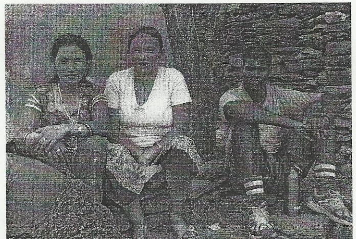
Br. Ayar with ladies from Tipling

Bank: Standard Chartered Bank Ltd., Nepal Swift Code: SCBLNPKA a/c Name: Nepal Jesuit Society a/c Number: 18-0003468-01